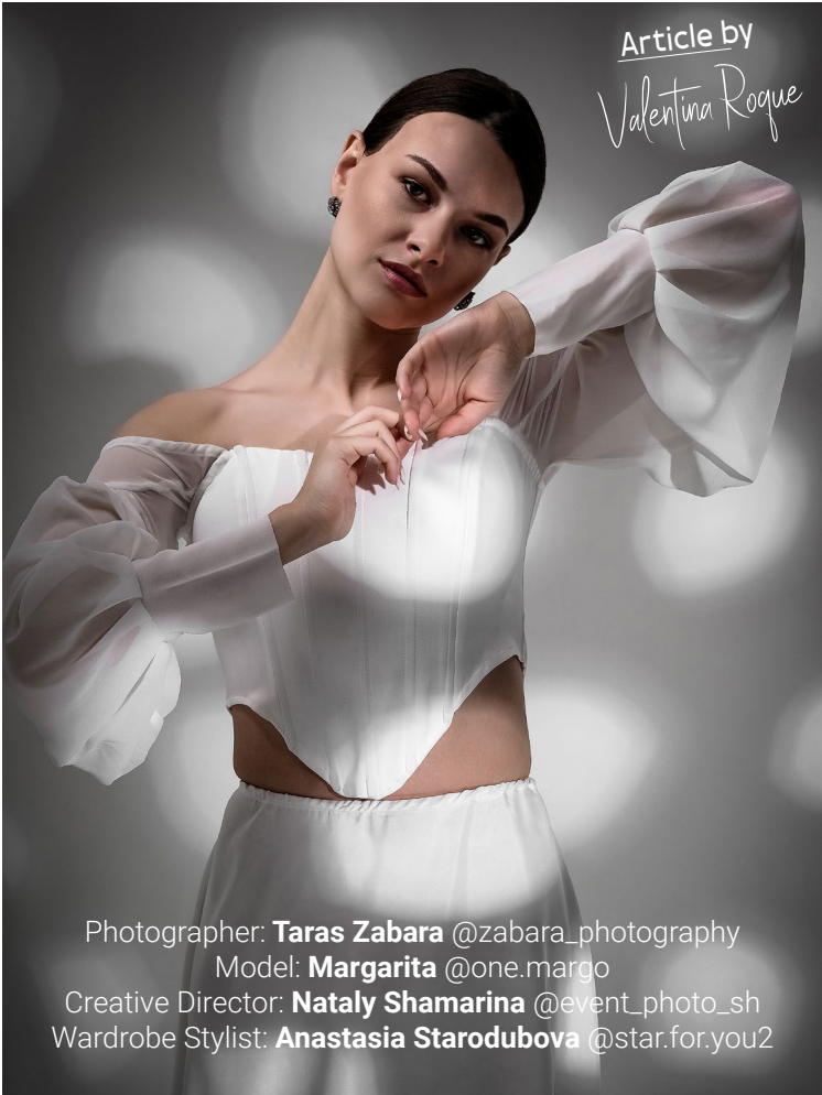
Article by Valentina Roque Model: Margarita @one.margo Creative Director: Nataly Shamarina @event_photo_sh Wardrobe Stylist: Anastasia Starodubova @star.for.you2

Experimentation is the name of the game when it comes to fashion, and the balloon-style trend is no exception. Don't be afraid to mix and match different balloon-style pieces to create a unique and personalized ensemble. For instance, you can pair oversized balloon pants with a more fitted top to strike a perfect balance. Conversely, try combining a billowy balloon-sleeved blouse with well-fitted trousers or a pencil skirt for an outfit that oozes elegance and style.